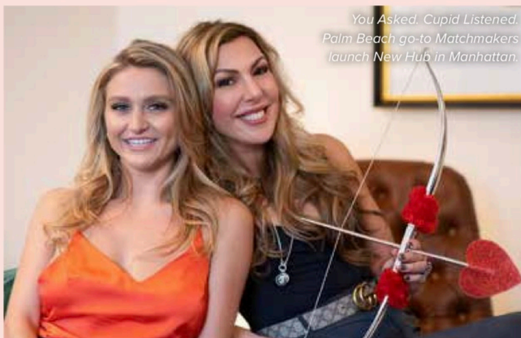
You Asked. Cupid Listened. Palm Beach go-to Matchmakers launch New Hub in Manhattan.