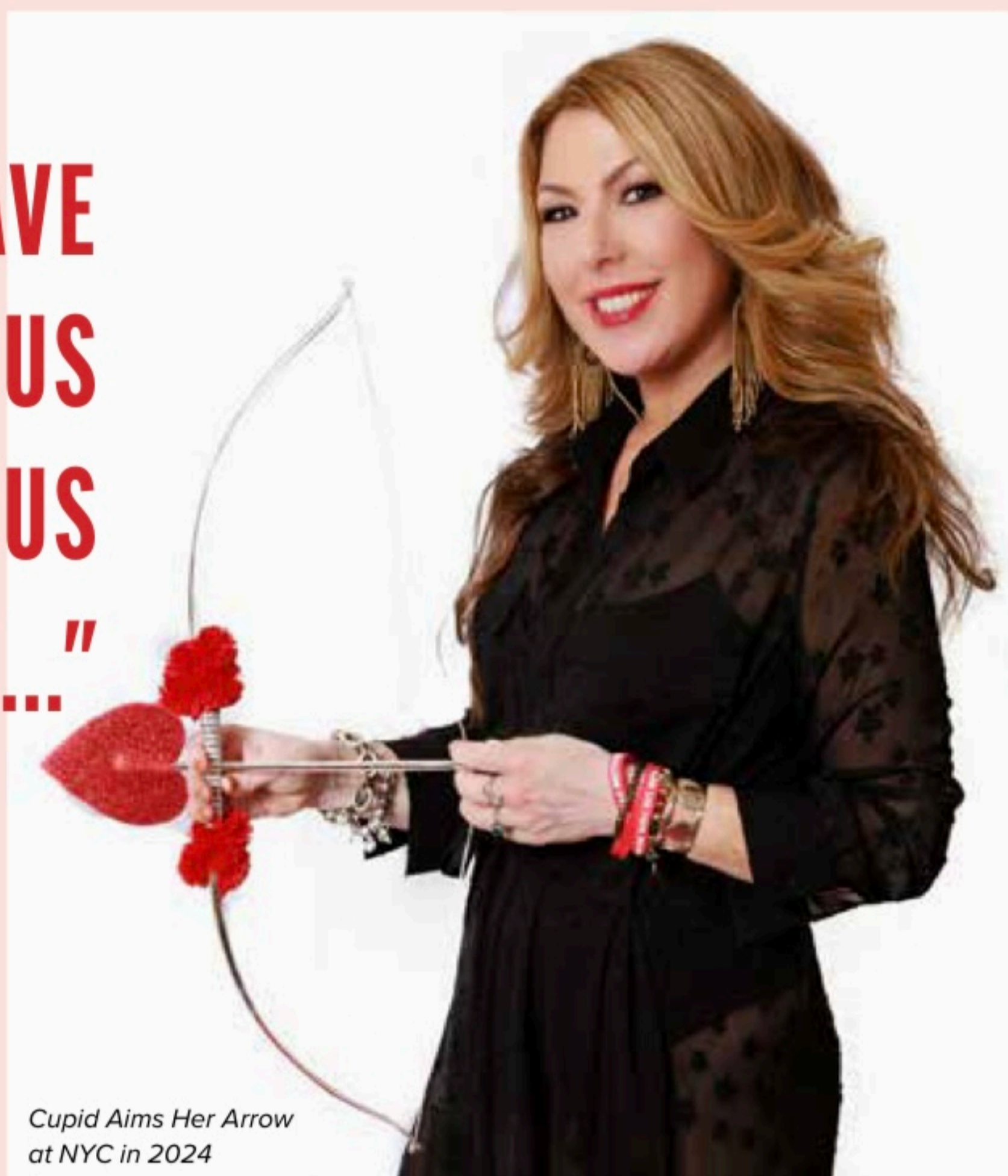
Cupid Aims Her Arrow at NYC in 2024