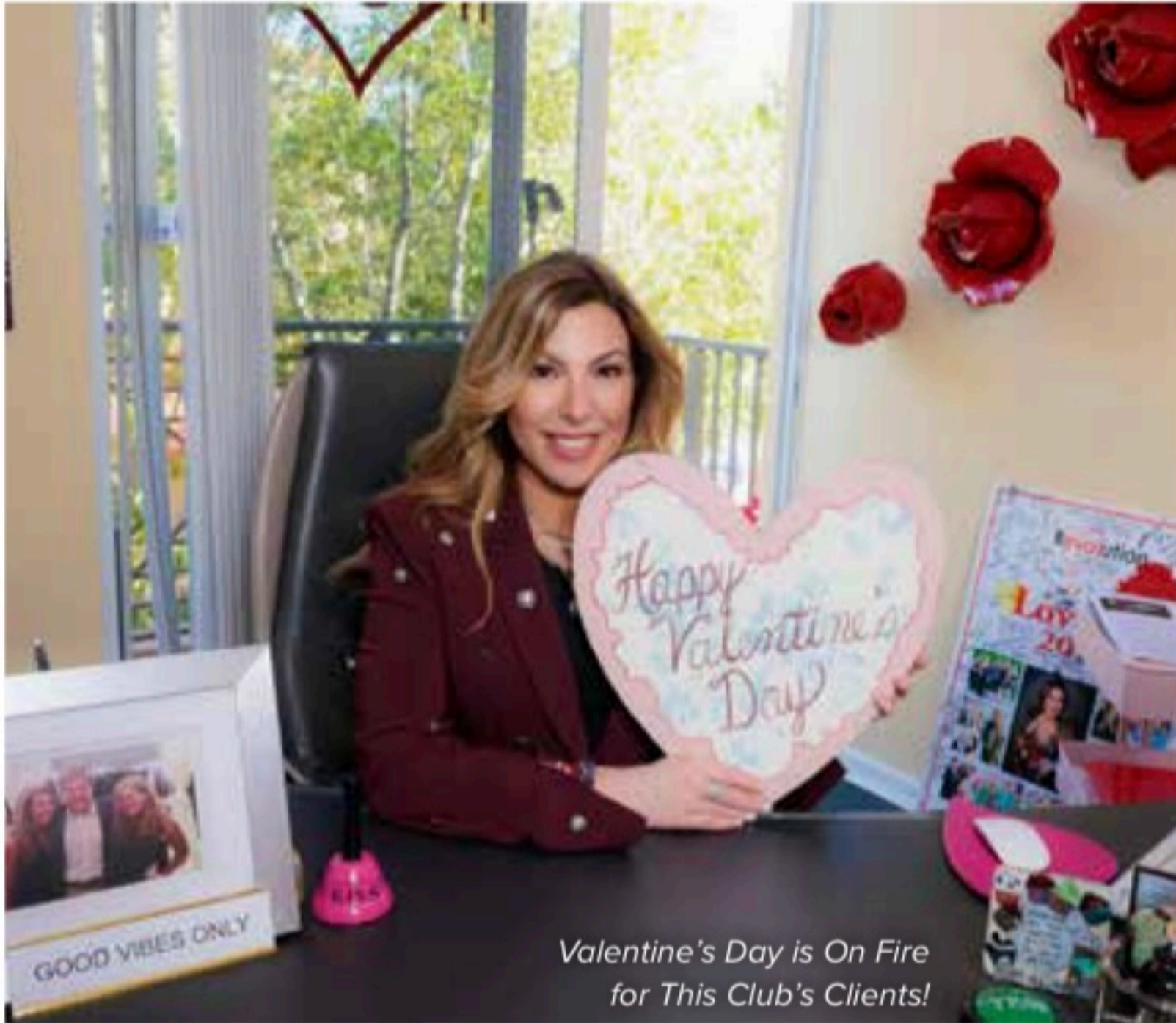
Valentine's Day is On Fire for This Club's Clients!